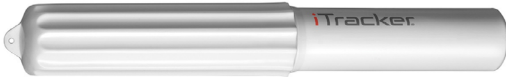
iTracker (Gen. 5) – Bluetooth | Cellular